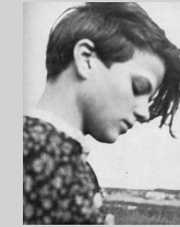
Sophie Scholl, a German girl who was executed for her part in actively and publicly resisting the Nazi regime

Duration: 1 hour Suitable for Grade 7-11