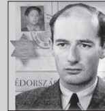
Swedish diplomat, Raoul Wallenberg saved thousands of Jews from the Nazis

Duration: 1 hour Suitable for Grade 9 -11