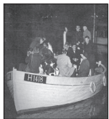
Danish boatmen rescuing Jewish Danes

Duration: 1 Hour Suitable for Grade 5 - Grade 12 learners