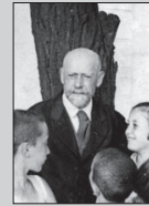
Janusz Korczak with orphans from the Warsaw Ghetto orphanage

Duration: 60 – 90 minutes Suitable for Grade 9 -11