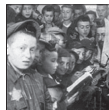
Spiritual resistance; Jewish children receiving lessons in secret

Duration: 1 hour Suitable for Grade 6 – 12 learners