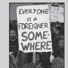
South Africans march against Xenophobia

Duration: 1 - 2 hours Suitable for Grade 9 -12