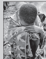
A grieving child during the Rwandan Genocide

Duration: 1 hour Suitable for Grade 9 -11